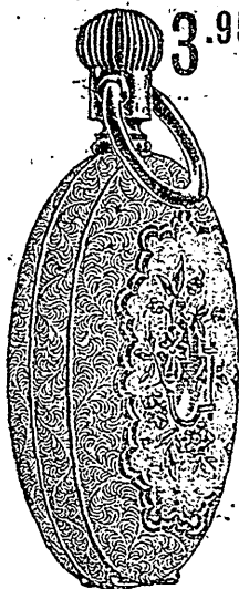
Hunting Case GENT'S OR LADIES' SIZE.