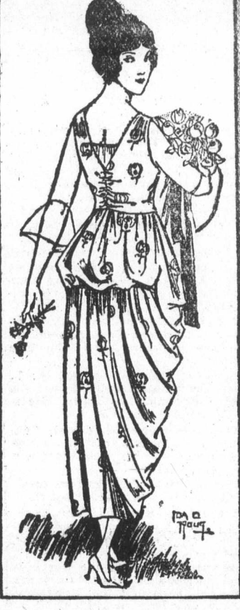
The "Wrapped" Skirt.

The "wrapped" skirt is of necessity rather narrow at its hem or lower-edge, inasmuch as a section of fabriccut the right length for a shirt is sim-