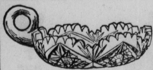
Cut Glass Bon Bon Dish For $1.50

As an inexpensive gift, nothing could be more acceptable than this beautiful Cut Glass Dish, which Diamond Hall is offering at $1.50.