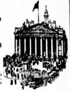
Head Office: Royal Exchange, London

Correspondence invited from responsible gentlemen in un-represented districts re fire and casualty agencies