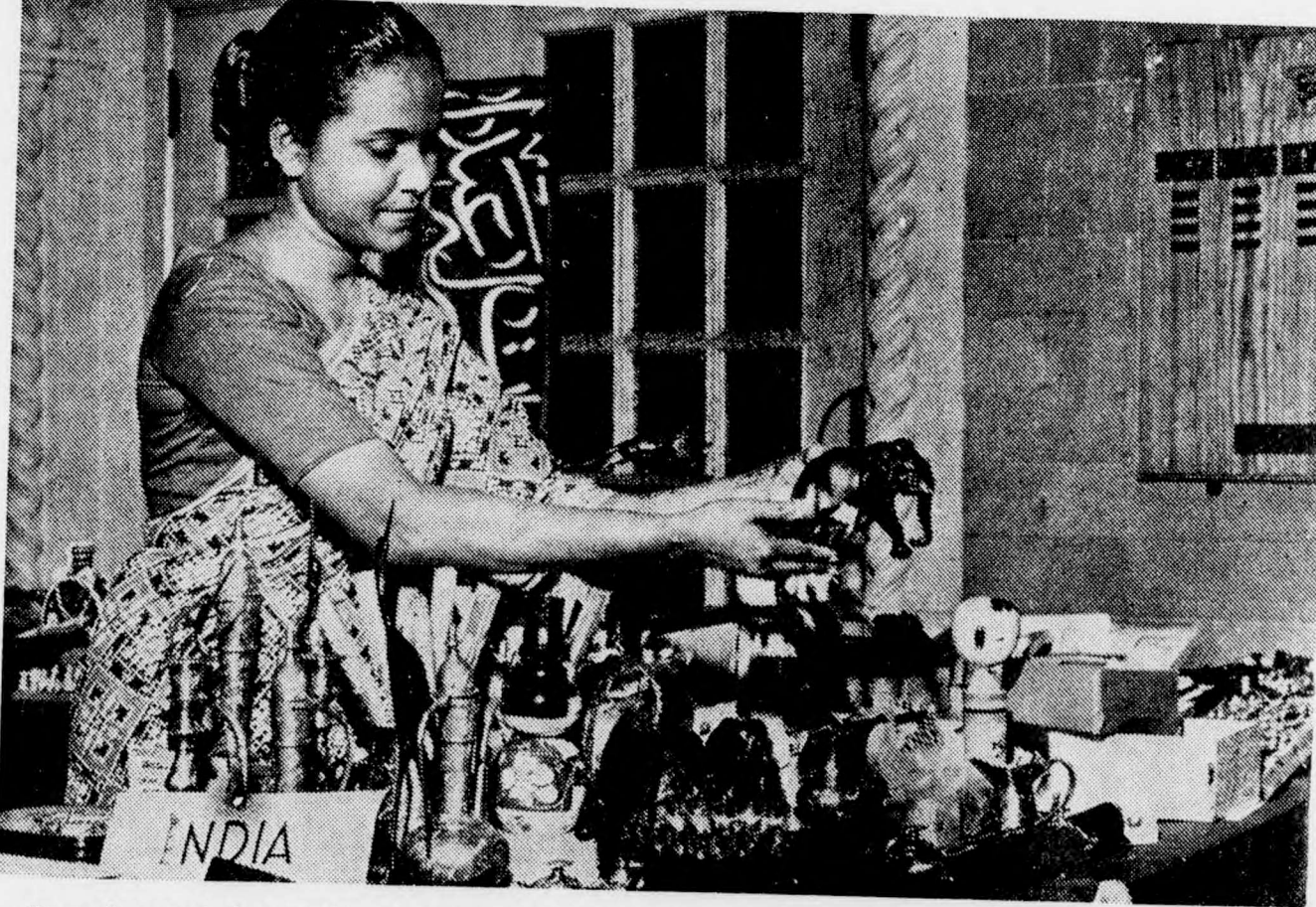
An exchange student working in Treasure Van sets up a display of Indian and Japanese crafts. Better than a dozen countries are represented in this year's sale.

vice of Canada, and the revenue from it enables WUSC to develop its programmes of international co-operation and assistance between students and professors in various countries. WUSC helps students overseas who are trying to cope with problems like inadequate accomodations and lack of classroom facilities, equipment and textbooks. Treasure Van will be at Glendon College, Bayview and Lawrence, in the Atkinson Common Room, from November 7 - 11, 10 a.m. to 10 p.m.