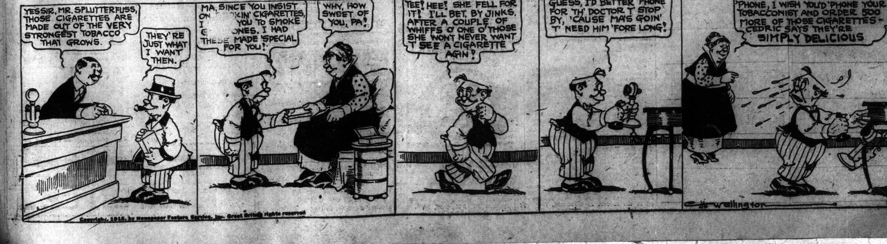
Copyright, 1915, by Newspaper Feature Service, Inc. Great Britain Rights Reserved.