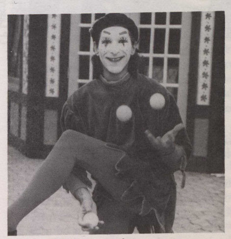
Some attractions are free. four minutes.

At a privateer's ship moored at Arthur's Bay, there will be fireworks and acrobatic stunts, and a chance to participate in the show.