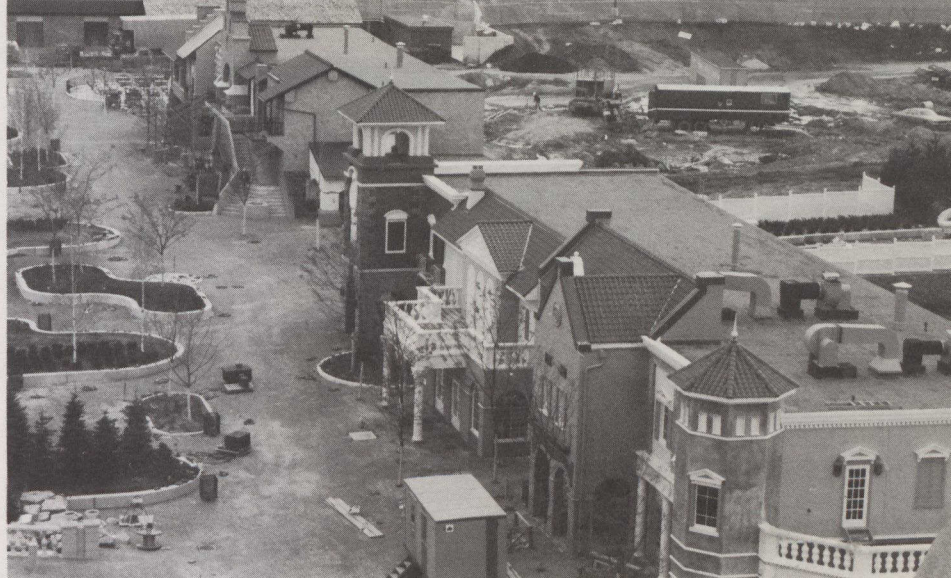
An aerial view of Canada's Wonderland taken in October 1980.