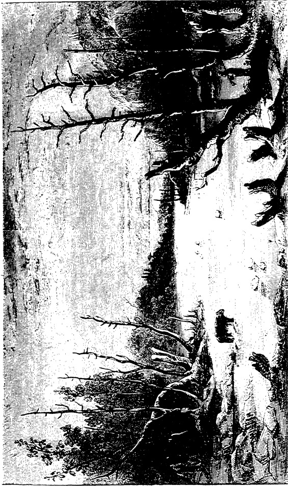
THE HUNTER OF CHIPPEWA