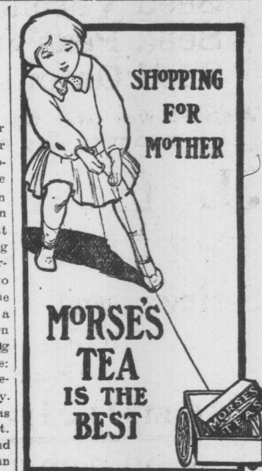
The Canadian Horticulturist

Resolutions expressive of gratitude for the hospitality of the Bridgetown people, the helpful services of the choir, and the courtesy of the press in giving prominence to the work of the Association in their columns. The sessions throughout were highly interesting and the attendance was fairly large. Hereafter this body will be divided into two sections, namely, the Southern Association, embracing the counties of Yarmouth, Shelburne and Queens, and the Western, embracing Digby, Annapolis and Lunenburg.