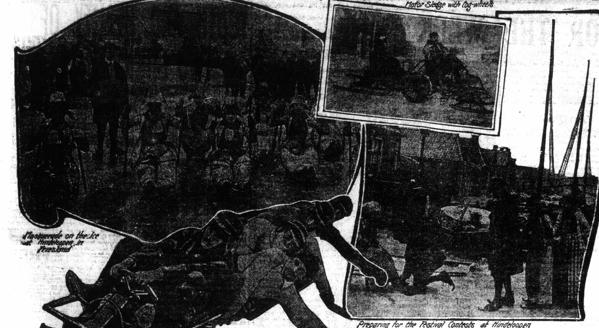
Motor Sledge with Cog-wheels. Preparing for the Festival Contests at Hindeloopen

offer is a straight forward business, I am in good health and can do social and Christian refer to I am ready at any moment to make the sacrifice for a reasonable