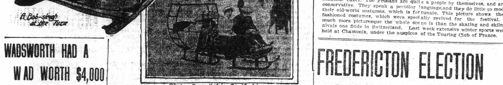
Sledge Propelled by Air Machine