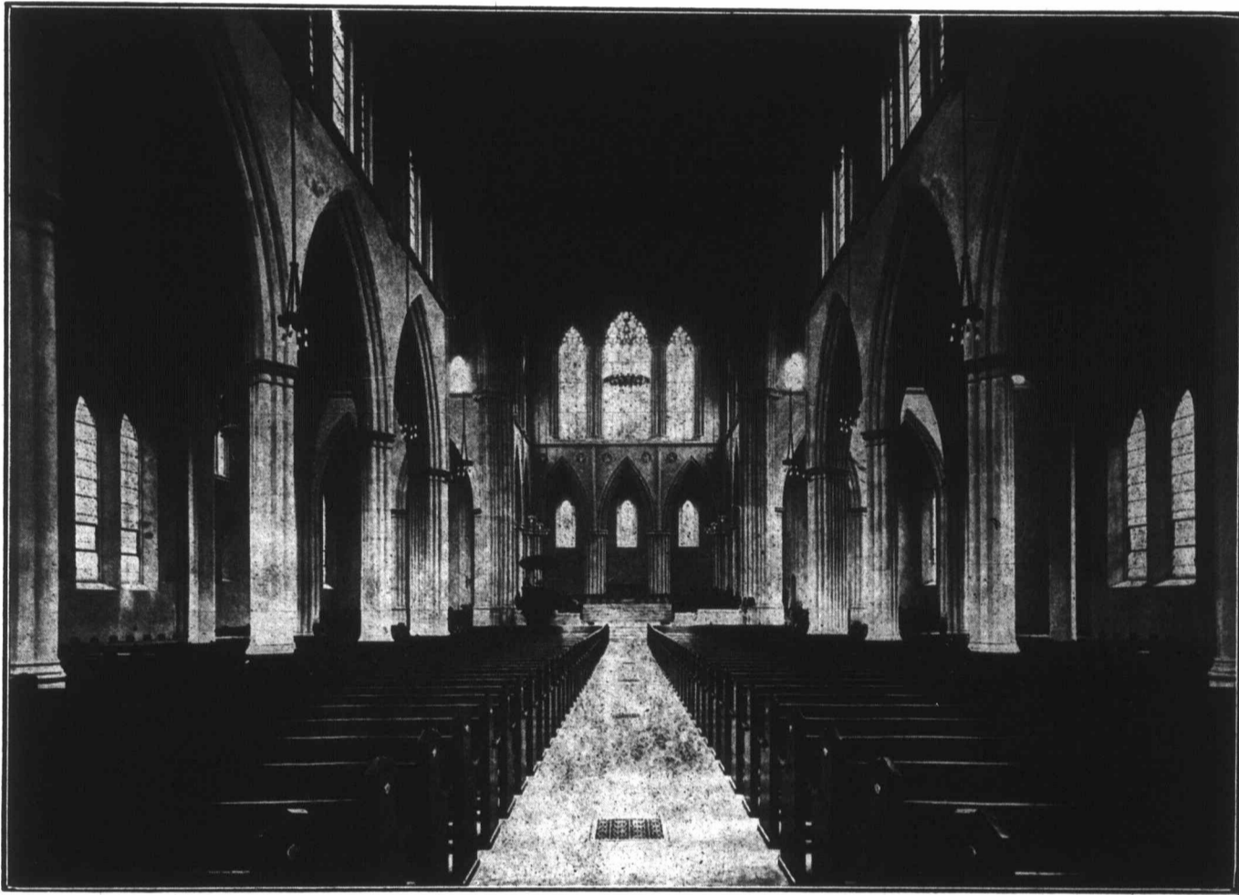
INTERIOR VIEW OF NEW ST. PAUL'S, TORONTO.