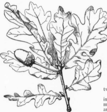
COMMON ENGLISH OAK.

ingly mossy-cupped acorns readily distinguish it from our English species.