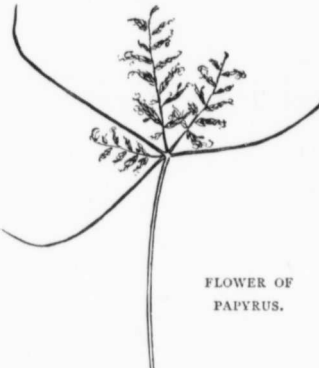
of this reed appear to have been used as an article of diet, and when stewed and served with a rich kind of sauce it was reckoned, by both Jews and Egyptians, as a table

papyrus which was my pattern. The sap of the plant appears to possess an adhesive quality, so that no gum is required, the action of heat being sufficient to make the strips unite into a flat even surface, suitable to be written upon with a quill and ordinary ink. In olden times the young succulent shoots