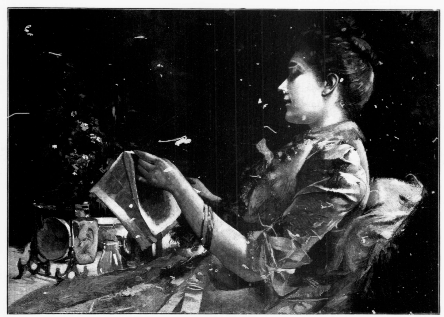
BEFORE THE WORK OF DAY.