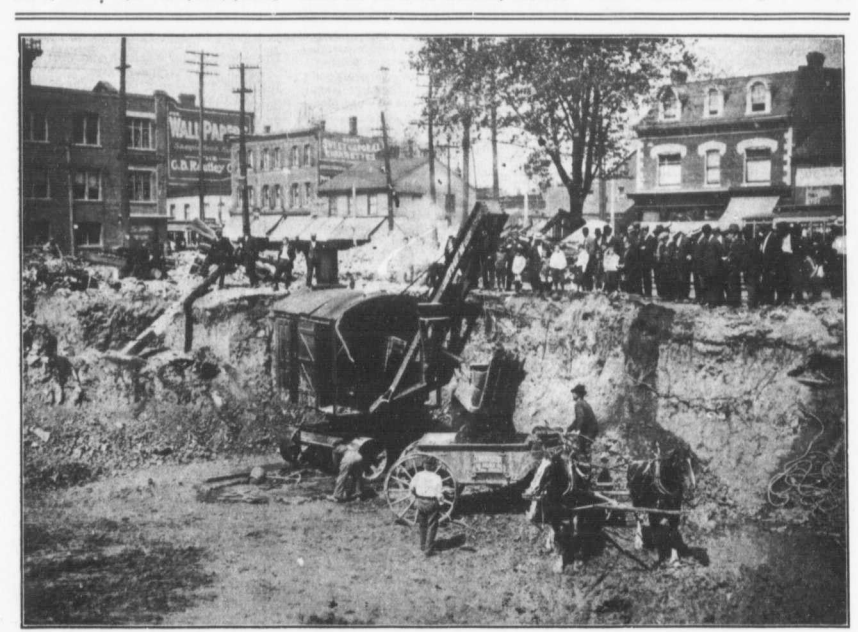
EXCAVATING FOR THE FOUNDATION OF THE NEW WESLEY BUILDINGS, JOHN STREETS, TORONTO.

"No, we shall not leave to-morrow," the Scout Master smiled. "Indeed, I rather think we shall put our whole two weeks of vacation here. It's an ideal place for camping, with good water, a stream for fishing, and thick, wild woods for the Scouts to hunt in and explore. That's what we started out for, and I don't think we can be better suited than right here. I talked it over with most of the Scouts, and they seem to be well pleased with the idea. Then one of them —the one you kissed good night and thought looked like your boy who was killed—broached another good idea that