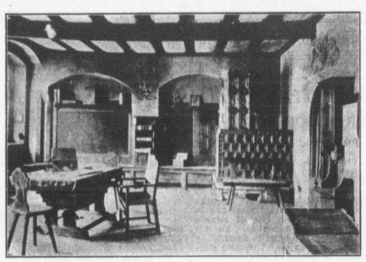
ROOM IN WHICH MELANCTHON STUDIED AND DIED.

"Believing as we do that the Bible represents a large contribution to the sum total of human knowledge and culture, and recognizing that because our present Public School currievium does not give adequate place to the Bible, many of our boys and girls are growing up without a sufficient knowledge of the Scrietures: that our Sunday School leaders in each Province make representations to the Department of Education remediate that a Course of Bible Study be outlined for High School students as an option for some subject on the curricu-