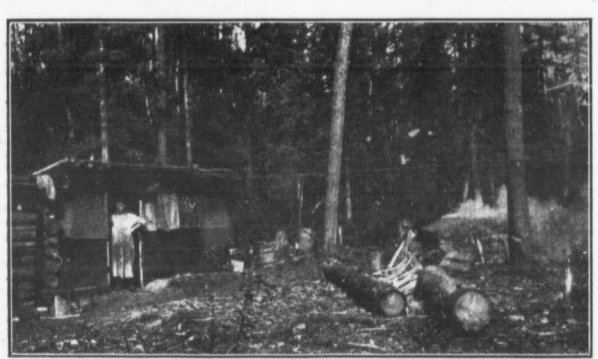
View shows dining shack for fifteen Finlanders working as stationmen, also boy cook. To the right the large clay oven is being fired red-hot for bread-making.

years to come, we shall be a nation of happy homes. If we can do this, then over the world will go, Canada's fame as the home of brotherliness, and the highest possible fame shall be ours, in the accomplishment of the fruest and best.