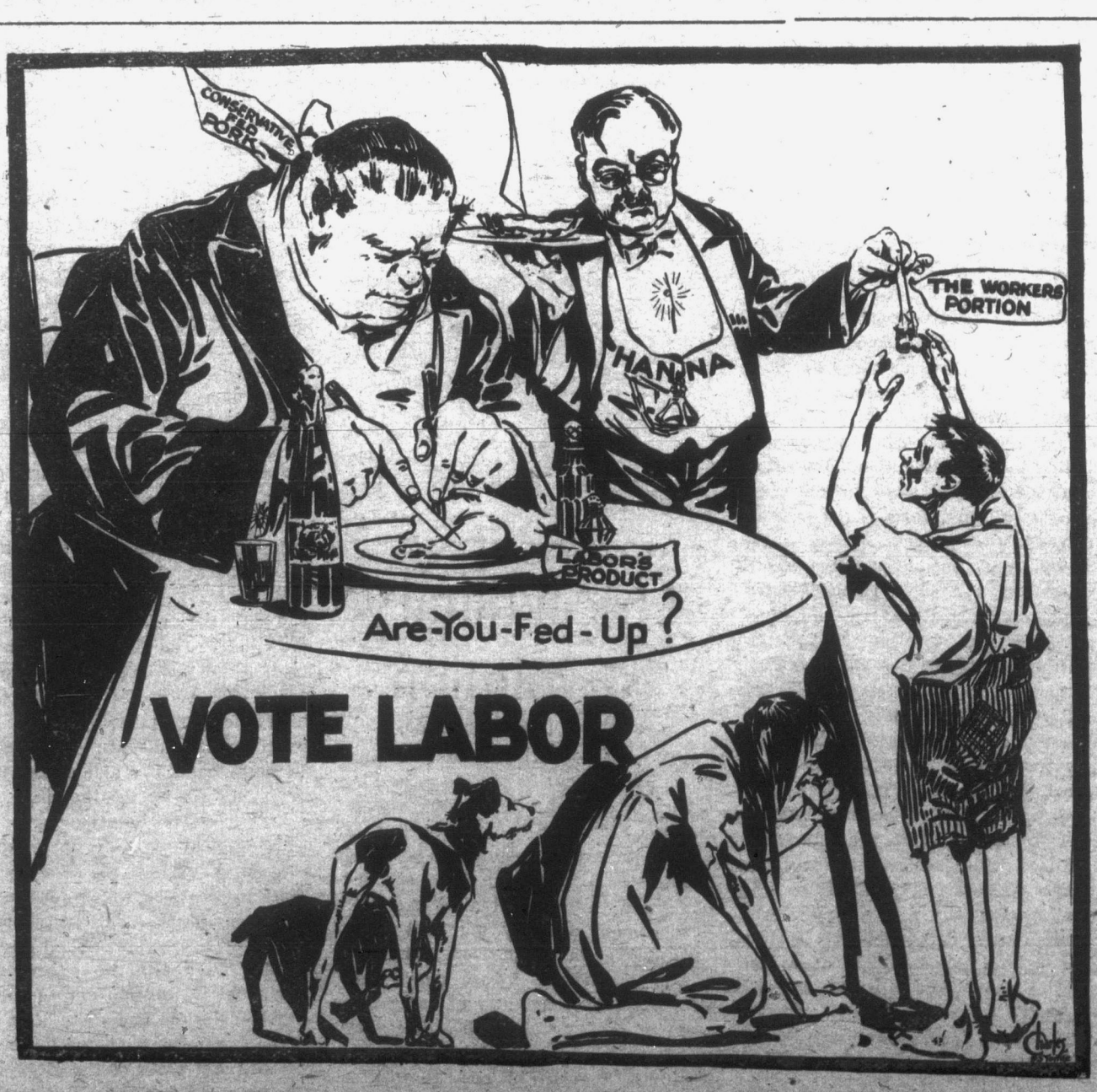
MR. HANNAS IDEA OF FOOD CONTROLL AS INTERPRETED BY THE FORWARD SPECIAL CARTOONIST.