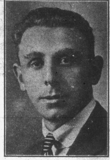
Social Democratic Candidate for Dominion Parliament in a Montreal District.

Ottawa Citizen: Premier Brewster is undertaking to put an end to political blackmail in British Columbia at least to the extent of prohibiting campaign contributions; by corporate - interests. The law to be anything like effective must enforce full publicity of all contributions to the political parties and publicity of election aid in any and all forms. Cynical opposition to a proposed measure of publicity of campaign contributions has been put forward in Parliament in the past. It has been contended that a law could easily be passed but what assurance would there be of enforcing it? Political leaders in the House of Commons in the days before August, 1914, took the position that until the Canadian electorate parged itself of corrupt tendencies nothing could be gained merely by passing electoral reform laws.