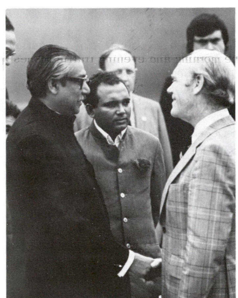
One of the newcomers to the Commonwealth is Bangladesh, whose Prime Minister Sheikh Mujibur Rahman (left) is welcomed to Ottawa by External Affairs Minister Mitchell Sharp.

"Heads of Government considered the special problems of countries highly dependent on exports of agricultural products in primary, semiprocessed, and processed forms, and noted the desirability of achieving substantial liberalization of trade in these products in the course of the forthcoming GATT multilateral negotiations. They underlined the urgent need for deliberate measures to be