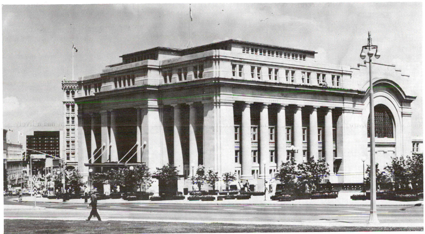
Conference centre in Ottawa, formerly the old Union Station, where the 1973 Commonwealth meeting took place.