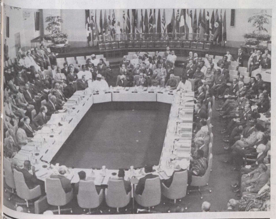
Ottawa meeting of Commonwealth Heads of Government