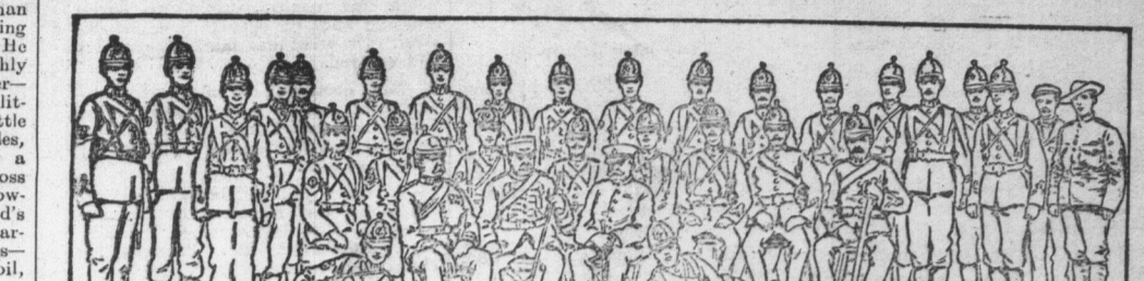
THE BOVRIL BEAVER COMPANY.