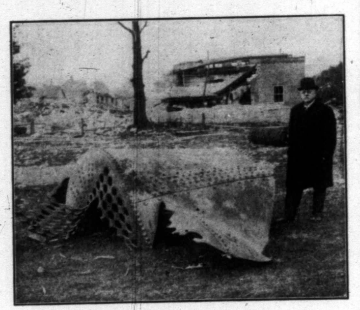
Building and Boiler after the Aylmer Explosion. Pounds' Boiler was thrown 300 Feet.