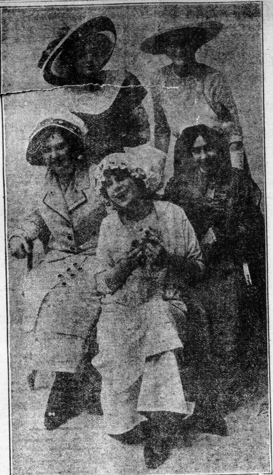
Some of the Passengers in the Pullman Car in the Farce, "Excuse Me." At the Grand Monday, Feb. 5.