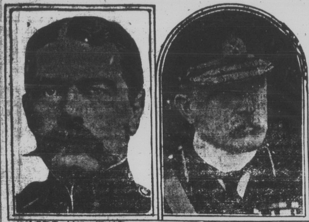
LORD KITCHENER Field Marshal Lord Kitchener, who is acting as British Secretary of State for War, and Field Marshal Sir John French, who is commanding the British armies in France, are the two most prominent generals pushing the British campaign against Germany and her ally.