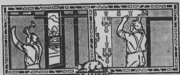
Nailing Beaver Board to new walls Putting Beaver Board over old walls

(Special to Graphic) London, Oct. 15th.—The Ger- man encircling movement to- wards the Channel has failed. Unofficial word received here in- dicates that the Belgian and British forces firmly contract- ed near Ostend had successfully effected a junction with a strongly reinforced column of French troops, and had inflicted assault in which the Germans lost heavily. The British forces are bearing brunt of this partic- ular fighting. The ultimate oc- cupation by enemy of Ostend is accepted and discounted. Block- ading fleet of medium strength, such as could easily be spared from flotilla of vessels now con- centrated off Heligoland, would render Ostend useless as base for aerial operations by enemy. The public in London continues in fear of Zeppelin raid, but mili- tary and aeronautical authorities point out that Germany would hardly be able to establish such an aerial depot at Ostend. A fleet off the Harbor could easily shell a Zeppelin hangar in the city and hangars are absolutely nec- essary for Zeppelin raids.