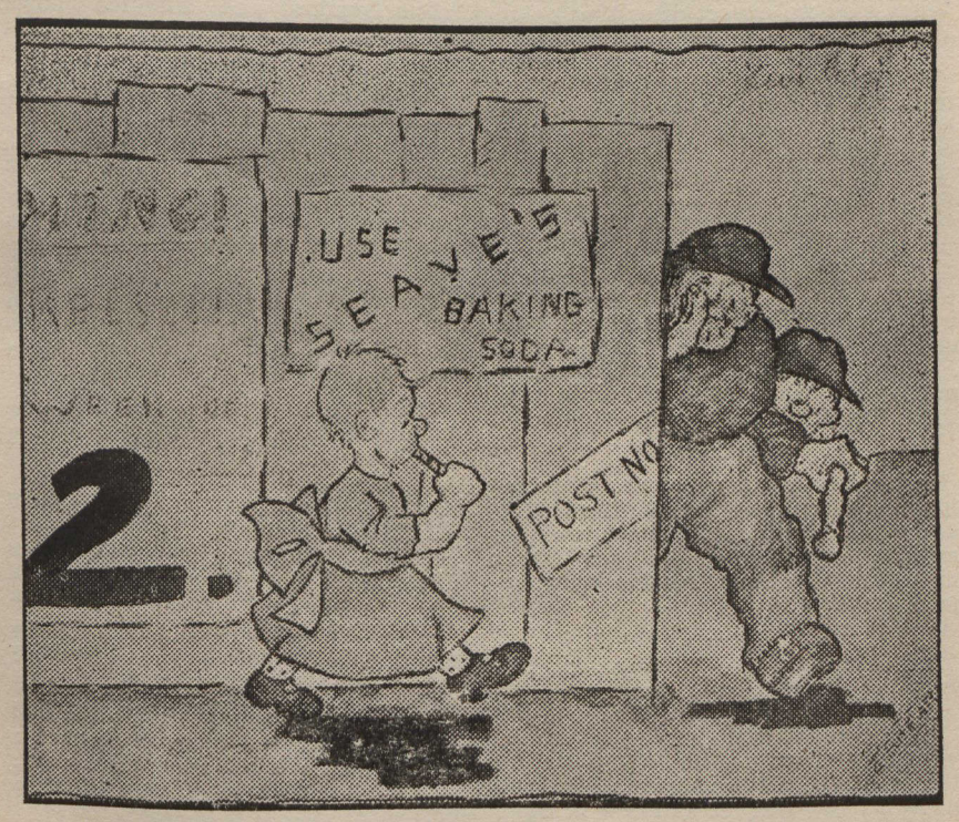
"Bill! There's someone comin', I'll 'old 'im up and if he shows fight you grab 'im from be'ind."