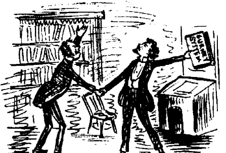
"TRADDLES, MY DEAR FELLOW, I'LL MASTER IT."