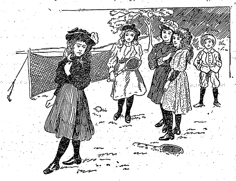
SHE FLUNG HER RACKET ON THE GRASS AND STALKED AWAY.

I am afraid she is! She was dreadfully delirious all night, they say, and talked of nothing but the