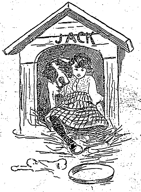
'WE FOUND HIM IN THE KENNEL.'

We found her to be a maiden lady of some 40 odd, with glistening spectacles, a kind-hearted face, but a primness about her mouth that told of prim ideas and ways. She found us a disconsolate little brood, missing our mother for the first time in our lives, hovered drearily about the fire in our comfortable living room, in the gathering dusk, consoling ourselves with Jack, as he was the only cheerful and sympathetic one of the