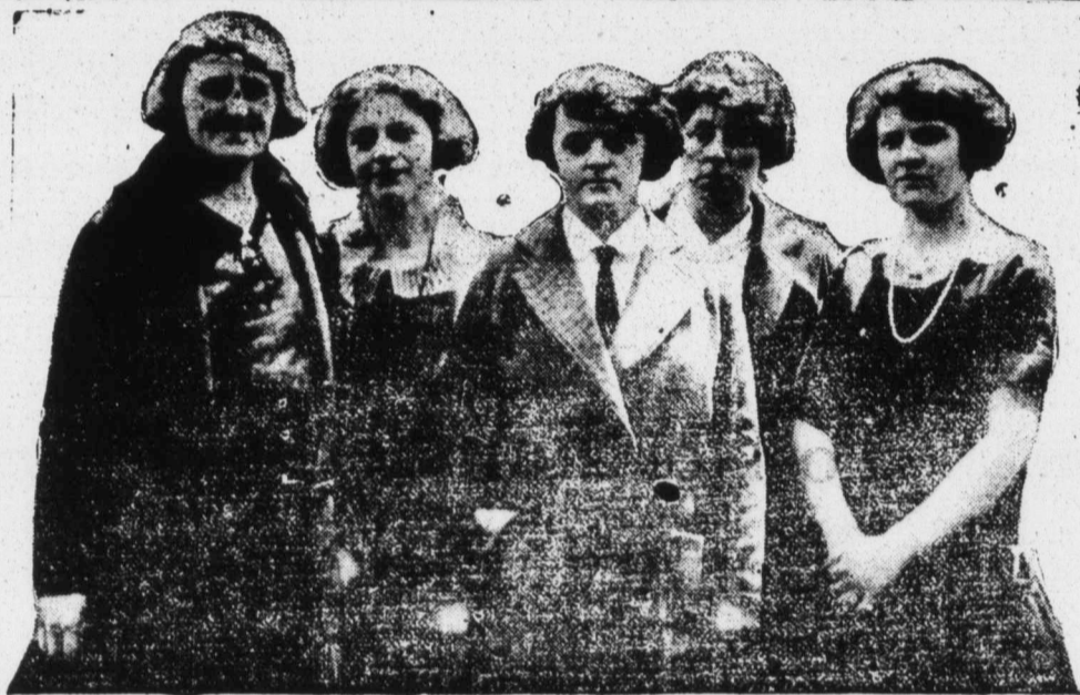
DOMINION OF CANADA FIRST AID CHAMPIONS

Loggieville---The Candidate with other Competent Speakers