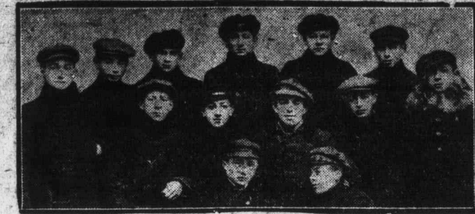
THEY ARE CATCHING 'EM YOUNG IN POLAND. Here is a group of Polish boys who are being conscripted for the Polish army.

The newspaper adds that the railways would be administered in four groups and that large economies in administration and cost of running would be effected. There now are 125 distinct railway companies, a majority of which are very small concerns.