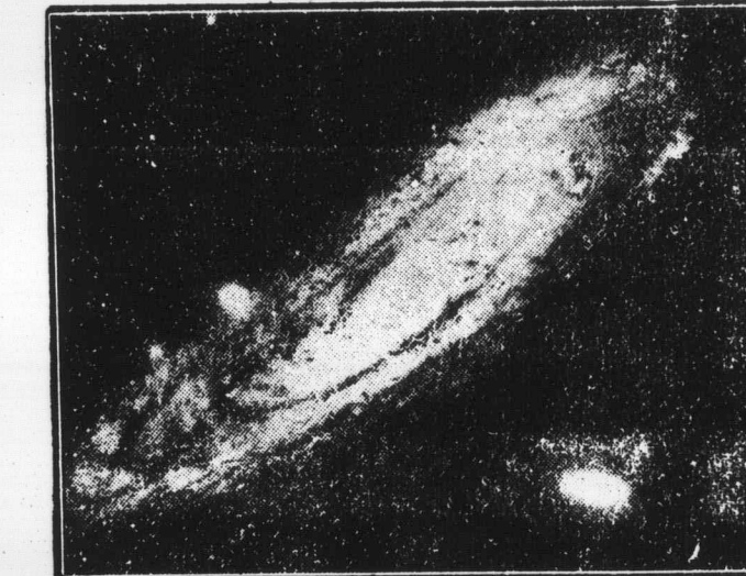
ANOTHER UNIVERSE! A photograph of a universe which may be as great in extent as our own. Situated in the outermost reaches of space and trillions of miles from the Earth, it is the only one of the millions of nebulae that can be seen with the naked eye. It has been observed in the constellation Andromeda, and its estimated velocity is about 330 kilometres per second. The cut is from a photograph taken at the Lick Observatory, California.

The efforts to induce Turkish troops to oppose Mustafa Kemal's forces appear to be becoming more difficult daily. Three thousand Turkish prisoners, who had just been repatriated from Egypt, mutilated when they were told they would be sent to Anatolia for this purpose. In another case of three thousand recruits, under training in the War Office compound, one third drew a month's pay and asked to go home to say good-bye to their families, but failed to return. The remainder are now being locked in the compound.