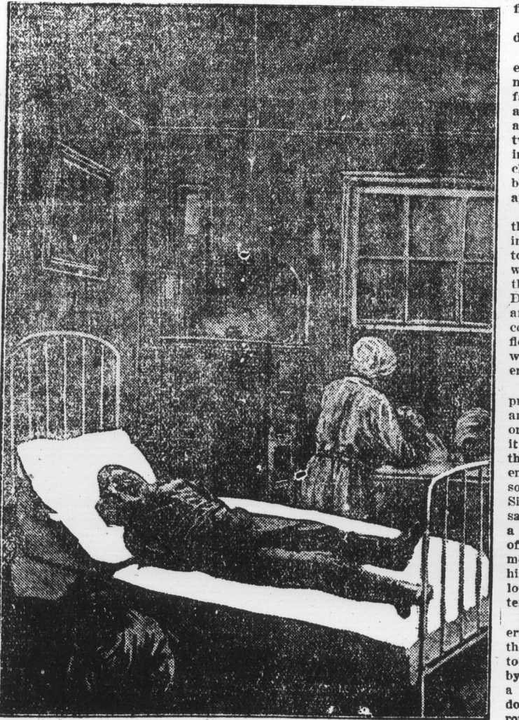
Lowered Them One by One.

"Officers are coming," was his report. Shallum seized the wheel of the machine.