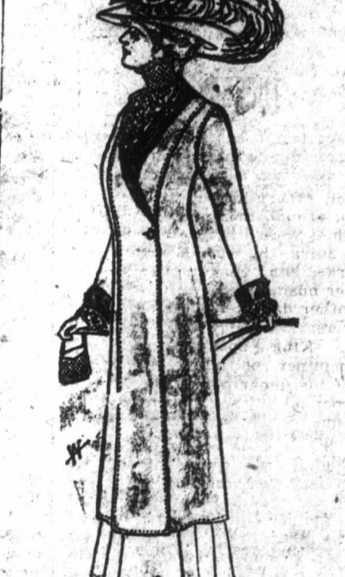
FIG. 3.—DRESS WITH THREE-QUARTER COAT, BEING SUPPLIED BY STITCHING.

OR a beautiful and smart costume of serge or similar material, an attractive new design is shown in figure 3. The original model was of dark blue serge with a shawl collar and ends of black satin. The design is unique among the season's styles for serge suits in that it has no visible trimmings, the pleat-