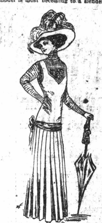
FIG. 1.—ODD COMBINATION OF PLEATS AND THE PRINCESS.

USUALLY the same princess as applied to a gown carries with it the idea of a severely plain garment without fold or pleat from neck to hem, but the new fashions pay no attention to the limitations of classic costume. Instead they seem to be engaged in violating every law which heretofore obtained in women's garments. In figure 1 the costume shown has certainly the general effect of a princess gown, and yet it is placed in a number of places, so much so, in fact, a very small portion of the surface is plain. Some suggestion of that moiree garment known as the costume of the 'moyen age' is in it. The model is most becoming to a slender per-