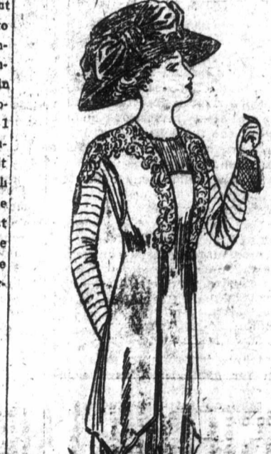
FIG. 2.—SLEEVELESS COAT TRIMMED WITH BRAID.

extending over the shoulders. Both the shoulder points and the points at the