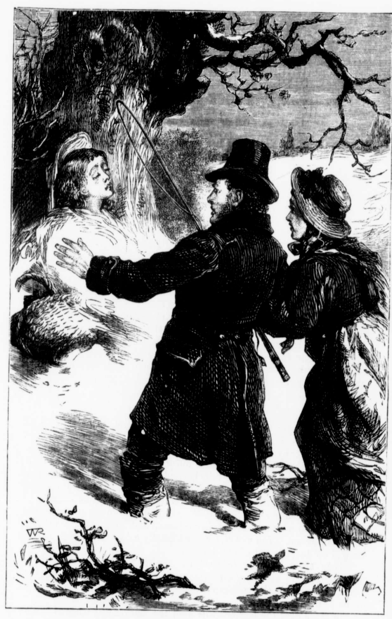
'It was a white, dead-looking, creature indeed that they discovered.'