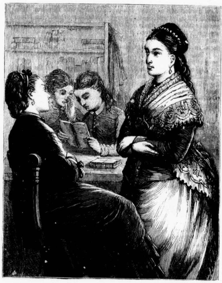
Lady Caroline entering the School-room.

'As for this young lady,' she added, waving her hand towards Mabel,