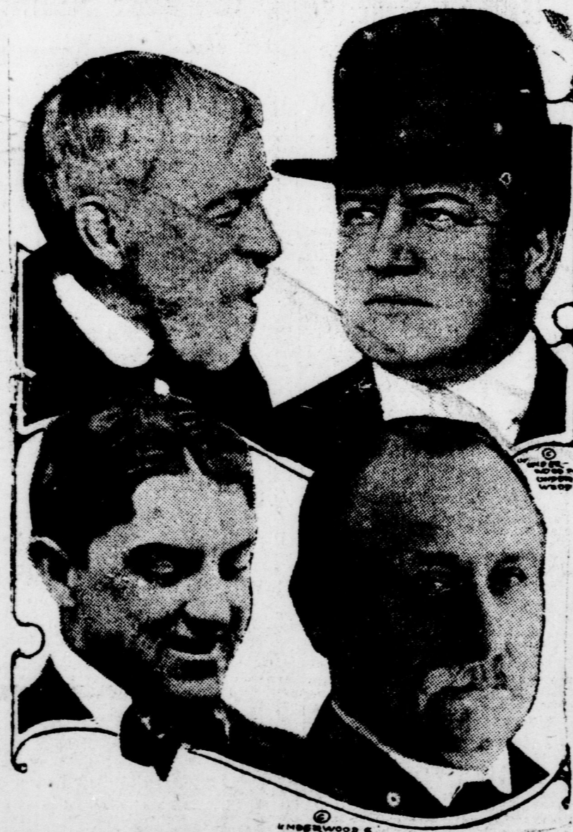
MEN WHO MAY BE ELIMINATED TO BRING BASEBALL PEACE AND THEIR PROBABLE SUCCESSORS.