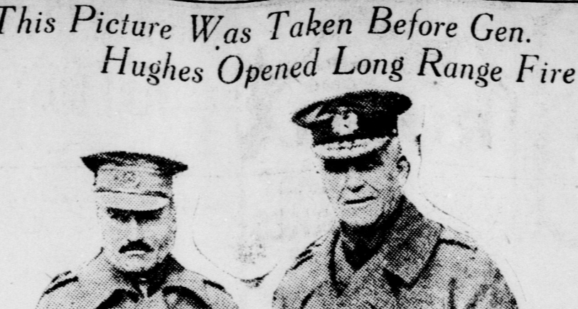
This Picture Was Taken Before Gen. Hughes Opened Long Range Fire.

FOR SALE Four city of London debentures, $1,000 each, running thirty years; to net purchaser $97.50.