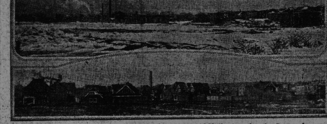
In the upper picture is given a glimpse of the devastated area of Halifax just after the disaster of a year ago. The lower picture shows the same district twelve months later after many houses have been built upon it.