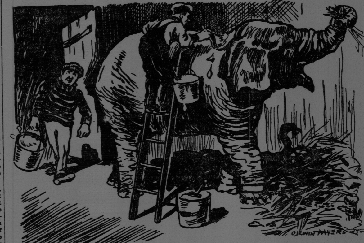
"THEN SAM AND HIS GROOM, TED FORD, PROCEEDED TO GET BUSY."

Dr. Morse's Indian Root Pills are just the right medicine for the children. When they are constipated when their kidneys are out of order—when over-indulgence in some favorite food gives them indigestion—Dr. Morse's Indian Root Pills will quickly and surely put them right.