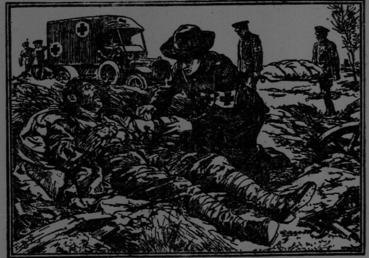
This illustration is a gift of the British Red Cross Society by Bernard Partridge, famous "Punch" cartoonist for use in a subscription campaign.