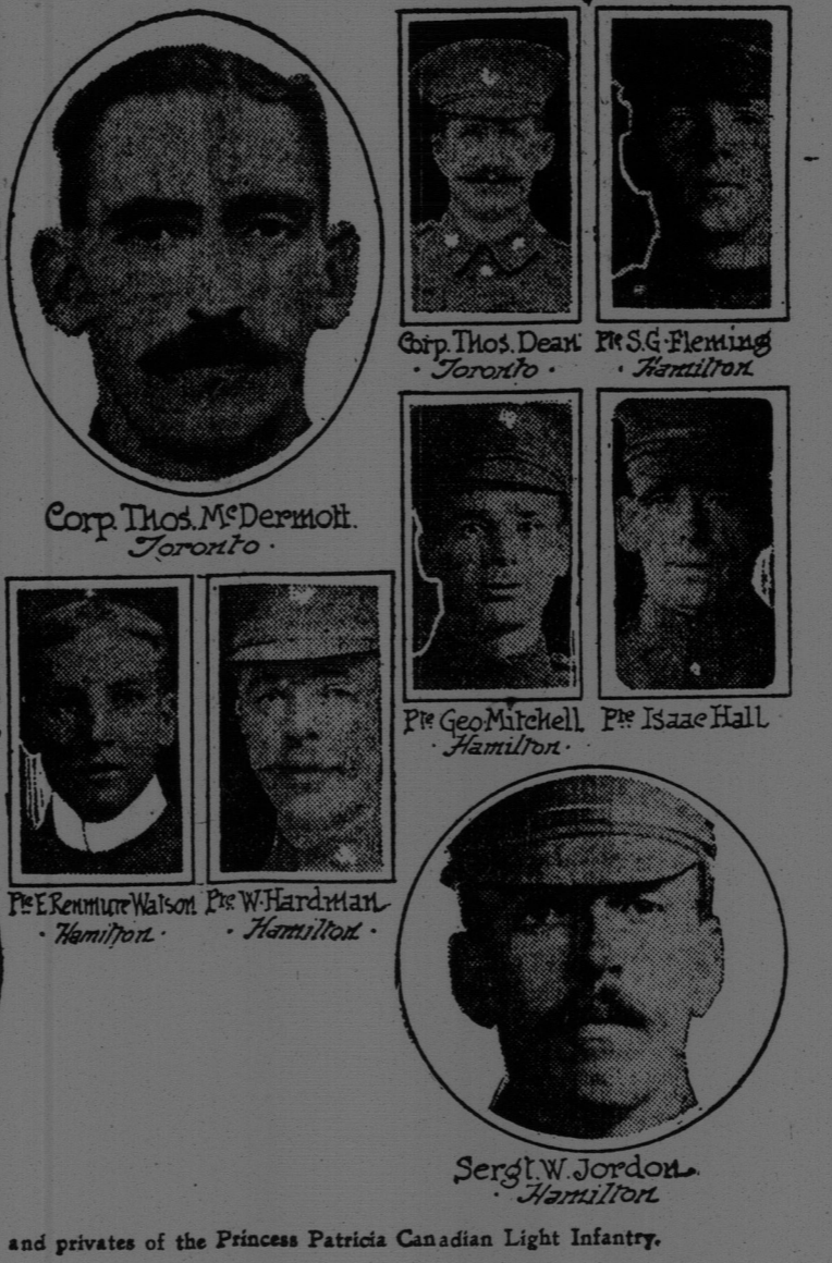
Some non-commissioned officers and privates of the Princess Patricia Canadian Light Infantry.