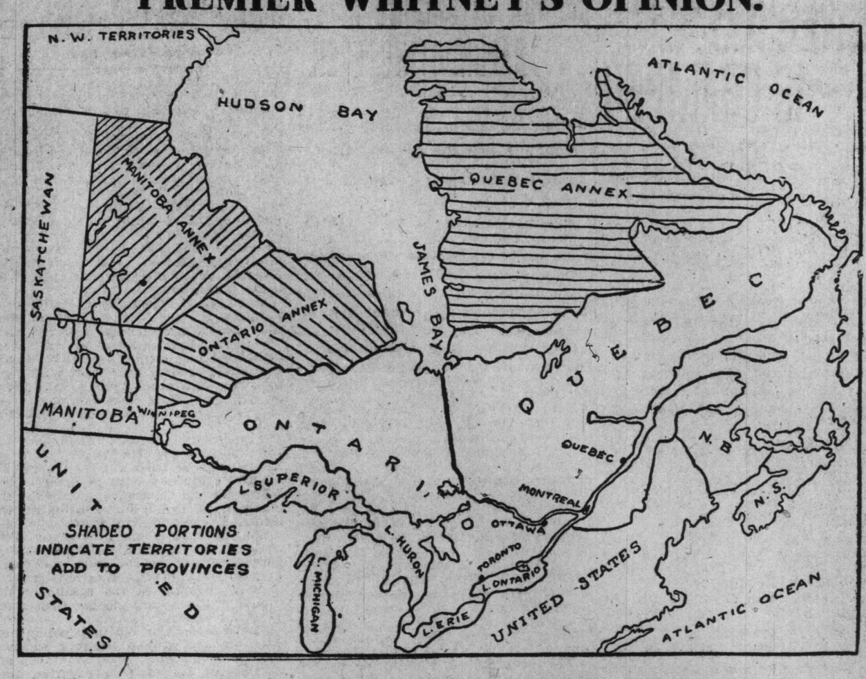
THE ENLARGEMENT OF T HREE CANADIAN PROVINCES.