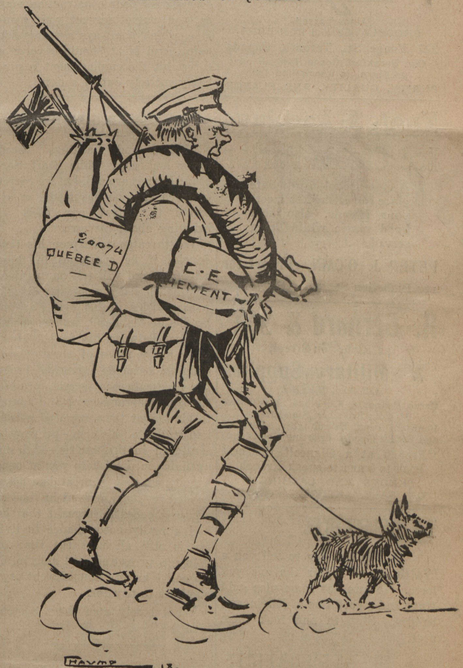
THE 'RAGS' OF QUEBEC

We called him Rags He chewed kit bags And ate our scraps of meat When on parade a fuss he made But lifted high his feet.