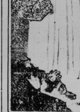
A PARISIAN MODEL. This gown is of pale blue crepe and is slightly fitted at the waist line.

Those who have separate poultry houses will find two factors to meet - either stuffiness and dampness, or the house is too cold.