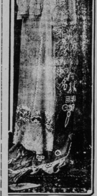
AFTERNOON TEA GOWN