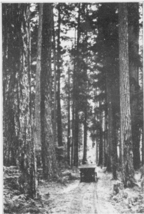
One of the many Auto Roads through Immense Forests on "The Island of a Thousand Miles of Wonderland"

"From Canada's Wheat Fields to The Island of a Thousand Miles of Wonderland"