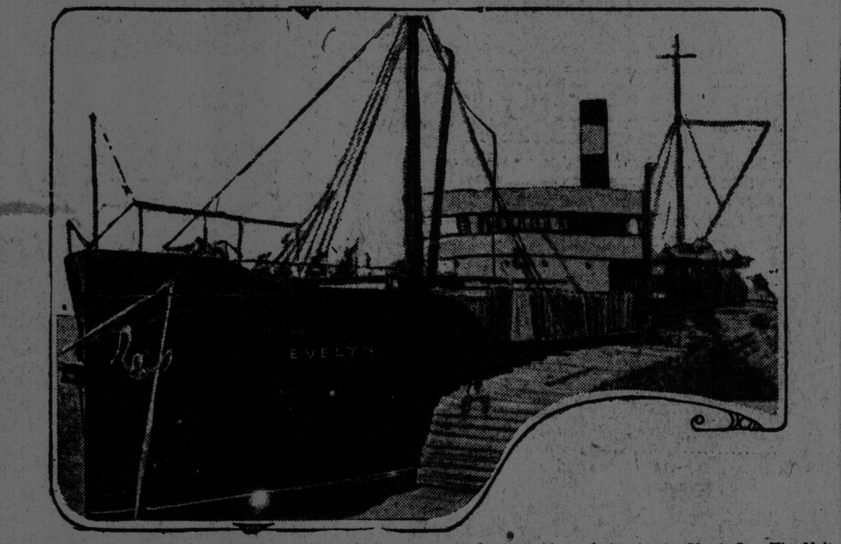
Here is a vessel flying the American flag which went down after a sudden explosion in the North Sea. The United States government is now investigating.