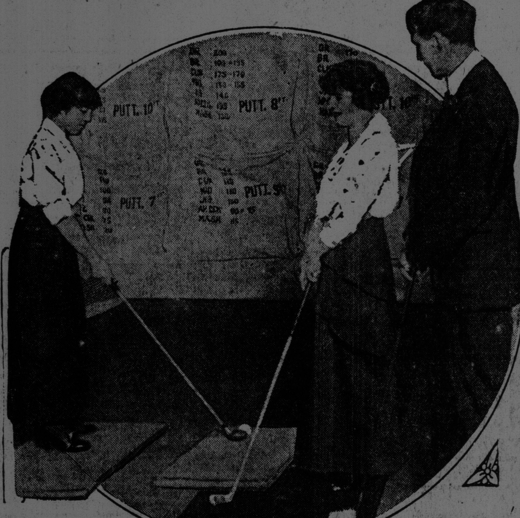
Chicago society girls playing golf on indoor course of Sportmen's Club of America.

Society Abandons Tango Teas To Play It In Restaurants and Athletic Clubs of Cities