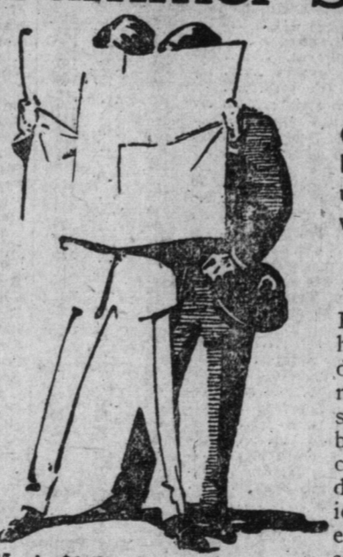
Men's $1.50 Straw Hats for 95c

Men's 3-Piece Suits, English and Scotch fancy worsteds and tweeds, in a large assortment of the newest shades and patterns.