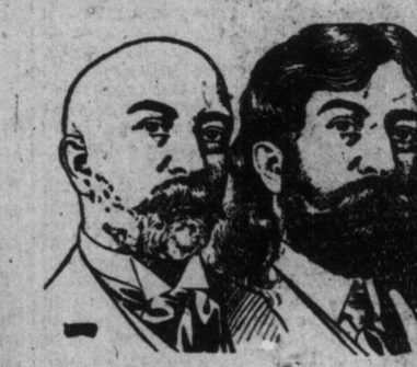
Nothing Quite So Nice As a Beautiful Head of Hair. Don't Be the Laughing Stock of Your Friends Any Longer. Use Foso.

Every Man or Woman May Have a Beautiful Head of Hair By Using The Wonderful Foso Treatment. Let us Send You Free a $1.00 Package Duty Free and Prove it to Your Own Satisfaction.