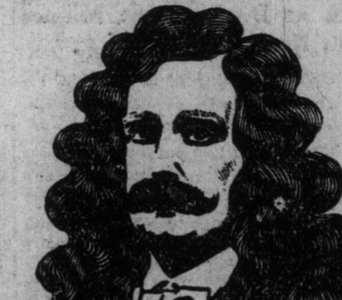
Nothing Quite So Nice As a Beautiful Head of Hair. Don't Be the Laughing Stock of Your Friends Any Longer. Use Foso.