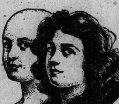
The Above Cut Plainly Shows What This Grand Remedy Has Done For Others. It Should Do As Much For You. Send To-day.

I Don't Ask You to Take My Word for It. Fill Out Free Coupon Below and Mail To-day for a Free $1.00 Package Duty Free, That Will Prove All I Claim.