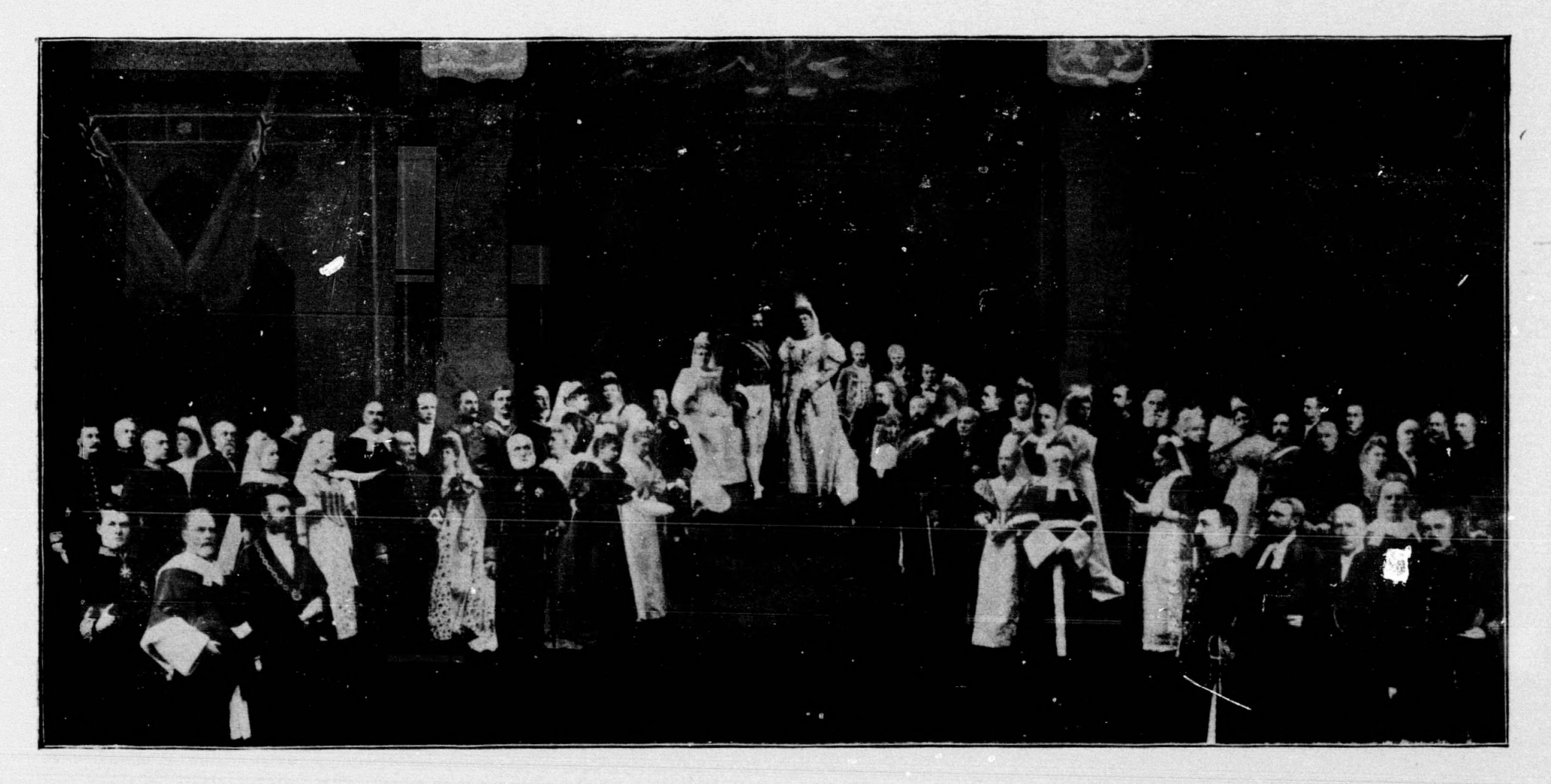
ILLUSTRATION OF THE VICE-REGAL GROUP

1 2 3 4 5 6 7 8 9 10 11 12 13 14 15 16 17 20 21 22 23 24 25 26 27 28 29 30 31 32 33 42 24 35 36 37 38 59 58 57 56 55 54 53 52 51 50 49 48 47 46 45 44 43 41 40 39