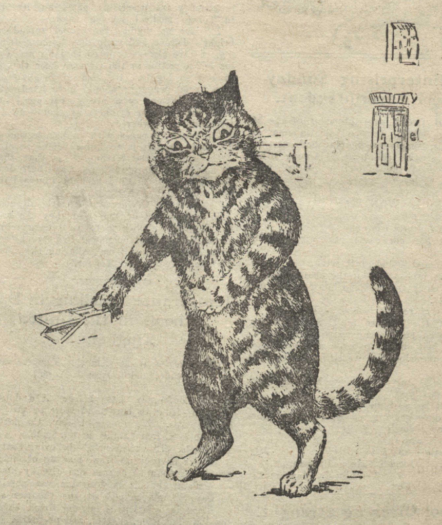
The Cat's Complaint.

When, to all appearances, Sir Toad was in the deepest of slumber, I saw him suddenly open his eyes, stretch his neck, cock his head toward a crack in the lower clapboard of the woodshed and stop breathing -at least I supposed so, for his little bellows was perfectly still.