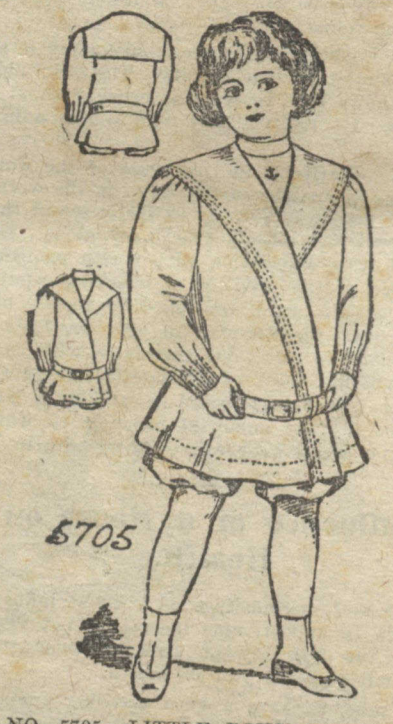
NO. 5705.—LITTLE BOYS' SUIT.

Where more than one pattern is wanted, additional coupons may be readily made after the model below on a separate slip of paper, and attached to the proper illustration.