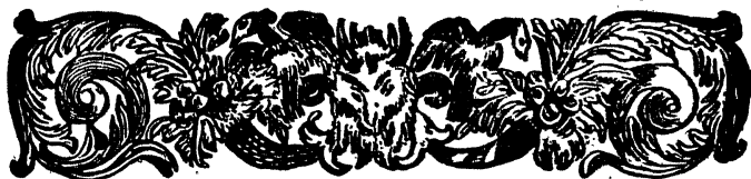
ILLUSTRATION TO VOL. X