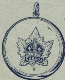
15ct. Gold Locket for miniature, with hand-chased Regimental Badge on cover. Any Military Badge can be similarly applied. £2 15 0

The Goldsmiths and Silversmiths Company undertake to carefully pack and forward this or any other Badge direct to any address at home or abroad. Postage Paid in the British Isles only. A Catalogue of Overseas Badge Jewellery will be sent on application.