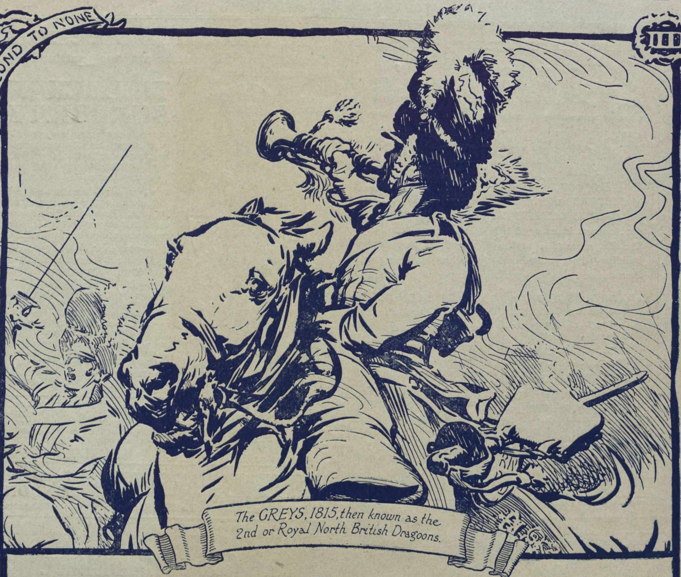
The GREYS, 1815, then known as the 2nd or Royal North British Dragoons.

20 for 1/- 50 for 2/6 100 for 4/9 Of all High-Class Tobacconists and Stores.