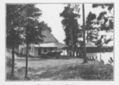
Fishing Camp on the Nepisiguit

Around the shores of La Baie de Chaleur the land is settled for many miles and the picturesque hamlets and green pastures add to the beauty of the scene. The swell from