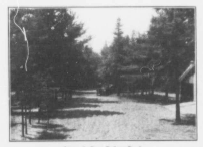
Among the Pines, Bathurst Beach

Chandler, a town which has sprung into being within the past few years, owes its existence to the St. Lawrence Pulp & Lumber Corporation. Their timber areas extend