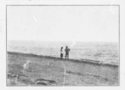
Beach, La Baie de Chaleur

bathing. Comfortable hotel accommodation is available, and there are several pretty bungalows occupied each summer by people from Campbellton. No finer site could be chosen for a summer home, and those desiring to build should have little difficulty in infuling a suitable location. Mention should be made of the drive from Dalhousie to Charlo along the shore road.