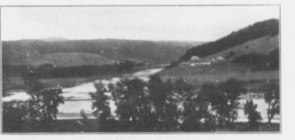
Meeting of the Waters, Matapedia and Restigouche

though thirty miles from the open gulf. Above Newcastle the northwest and southwest branches unite, forming a mighty stream, which is nearly a mile wide at the mouth. Vessels from all quarters of the seas may be seen loading lumber at the wharves of the saw mills along the shores in this vicinity and for miles below. From the railway bridges, indeed, as far as Loggieville, five miles below Chatham, are no less than half