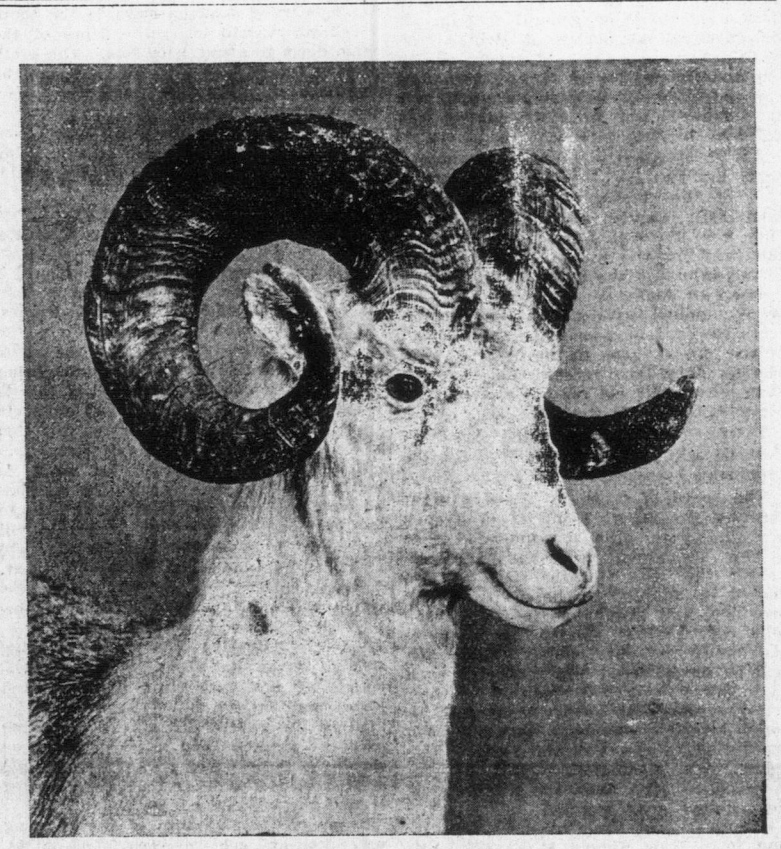
HEAD OF OVIS FANNINI.