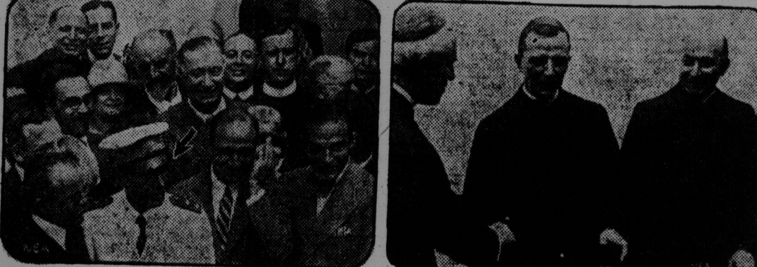
Simultaneous farewell parties for Gen. Umberto Nobile, North Pole flight participant, and John, Cardinal Bonzano, papal legate, were staged in New York. The arrow in the left picture points to Nobile. Down in the lower right hand corner is Rudy Valentino. In the right picture, Cardinal Hayes of New York is shaking hands with Cardinal Bonzano (center), with Cardinal Mundelein of Chicago standing by.

Every island suffered, as did Nassau, only on a somewhat smaller scale. During the late afternoon boats from the Florida coast began to negotiate the still choppy waters. Government officials stated it would be several weeks before an accurate check of the lives lost and the property damage could be made.