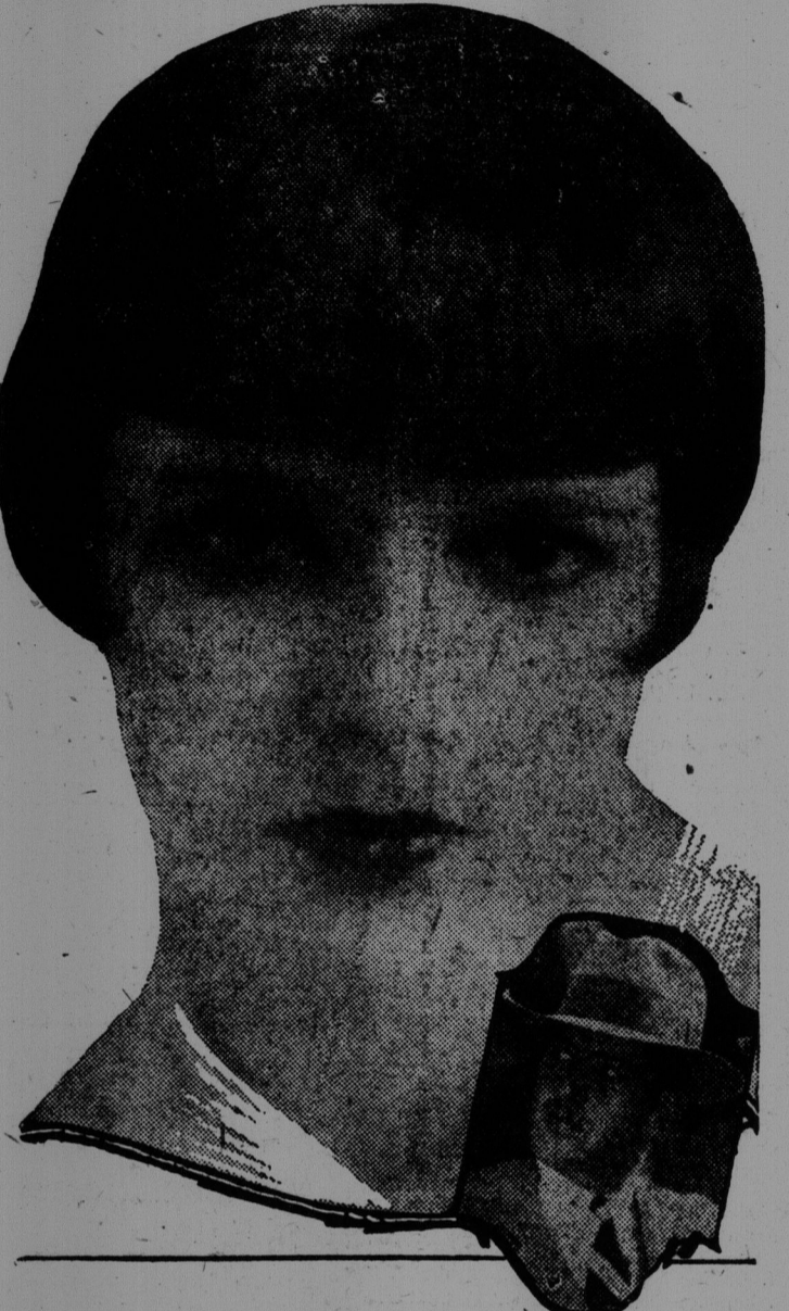
Louise Brooks, the striking beauty who has risen to film stardom from a beginning as a chorus girl, has become the bride of Edward Sutherland, inset, above, a motion picture director.