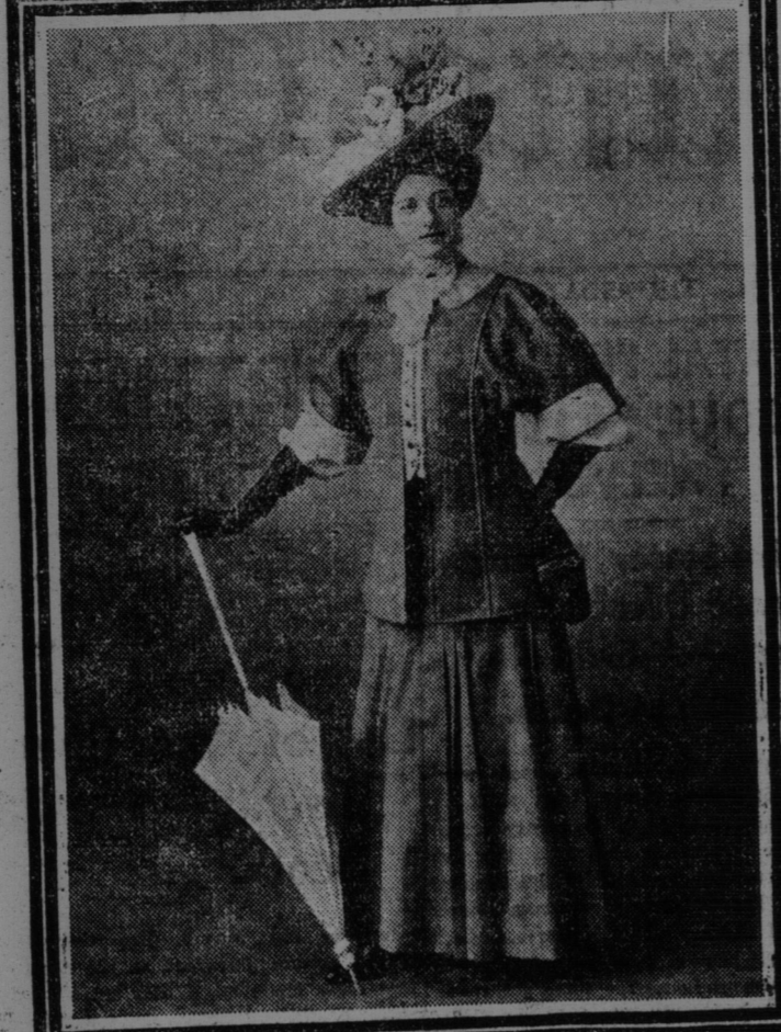
MOHAIR SHOPPING SUIT FOR SPRING

Double and triple box plaits are extensively employed for skirts of simply tailored suits. These are usually untrimmed, being finished about the bottom with a rather deep hem and at the waist with a princess or attached skirt.