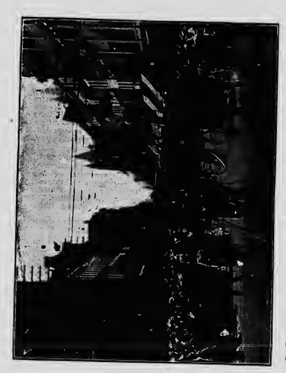
Yonge St., Toronto. See page U. For Industrial Opportunities write the Assessment Commissioner, Toronto.