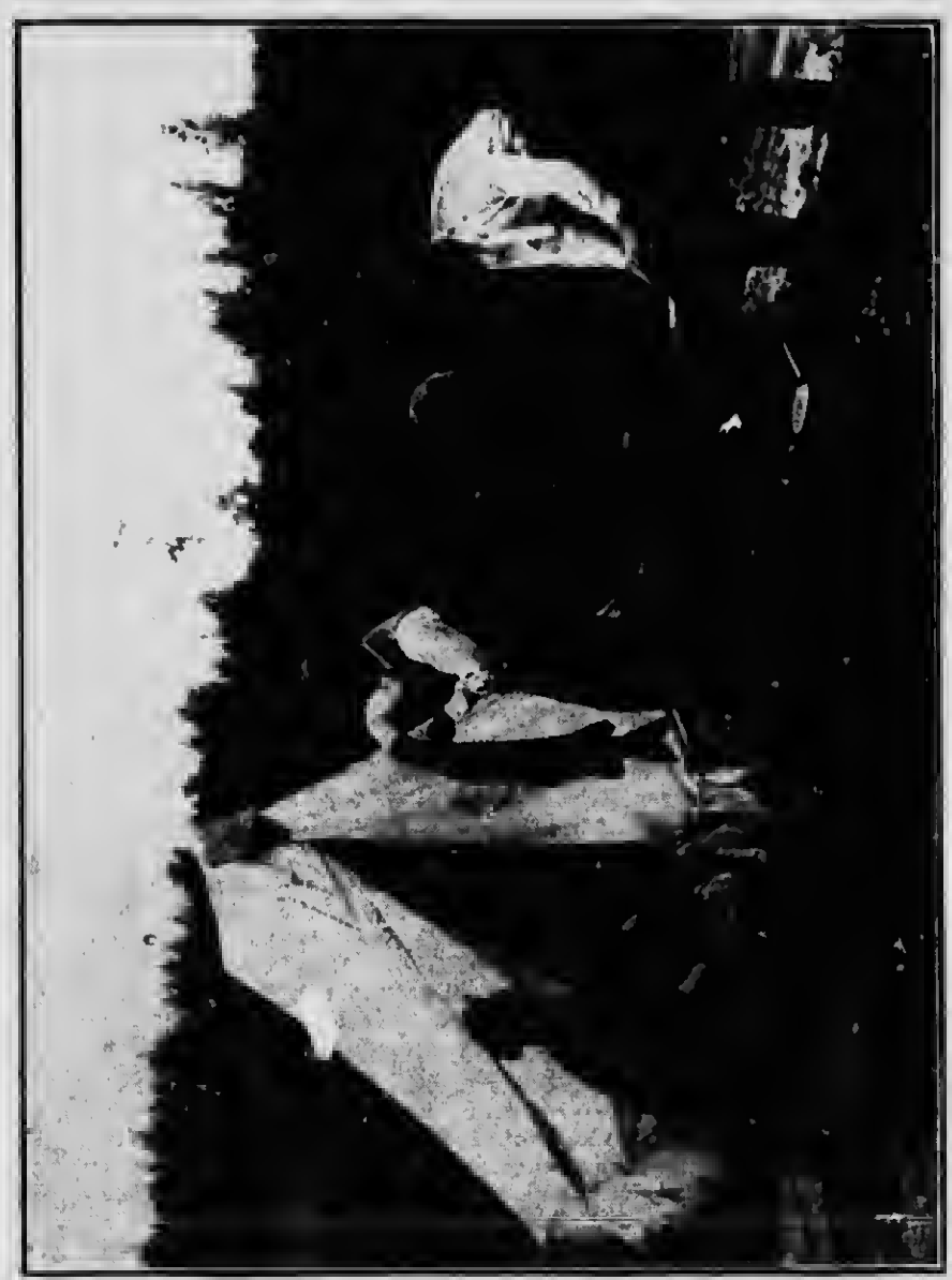
North Ontario-A Fishing Camp. See page 69.