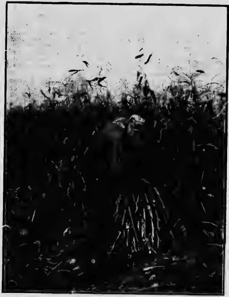
Indian Corn and Pumpkins. See pages 4 and 10.