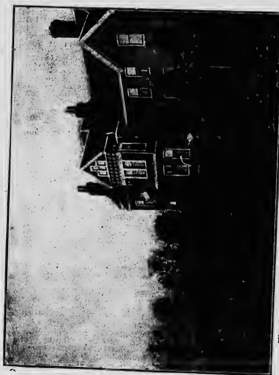
See Improved Farms, page 66. The Home of a Successful Farmer.