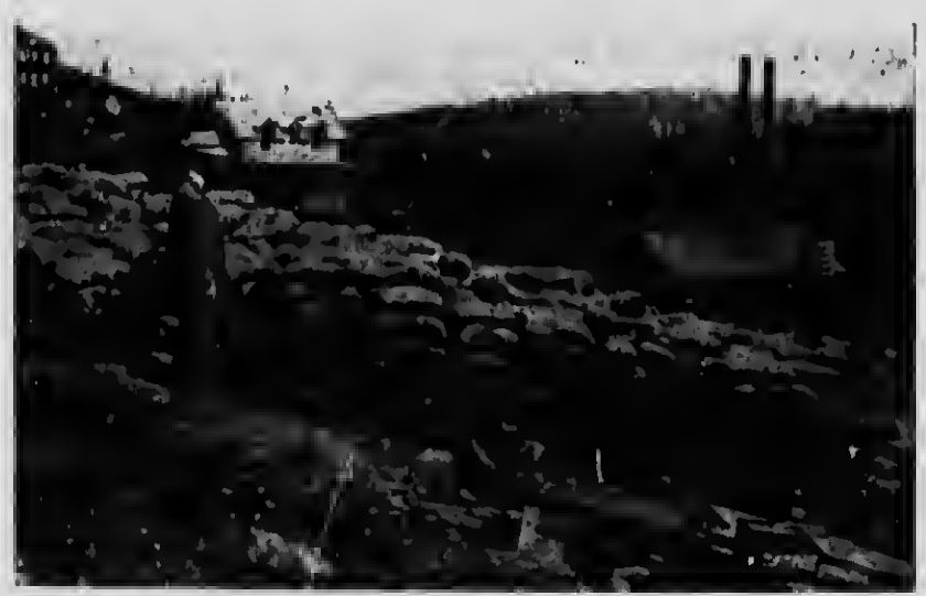
Cobalt Silver Bagged for Shipment. See pages 17 and 26.