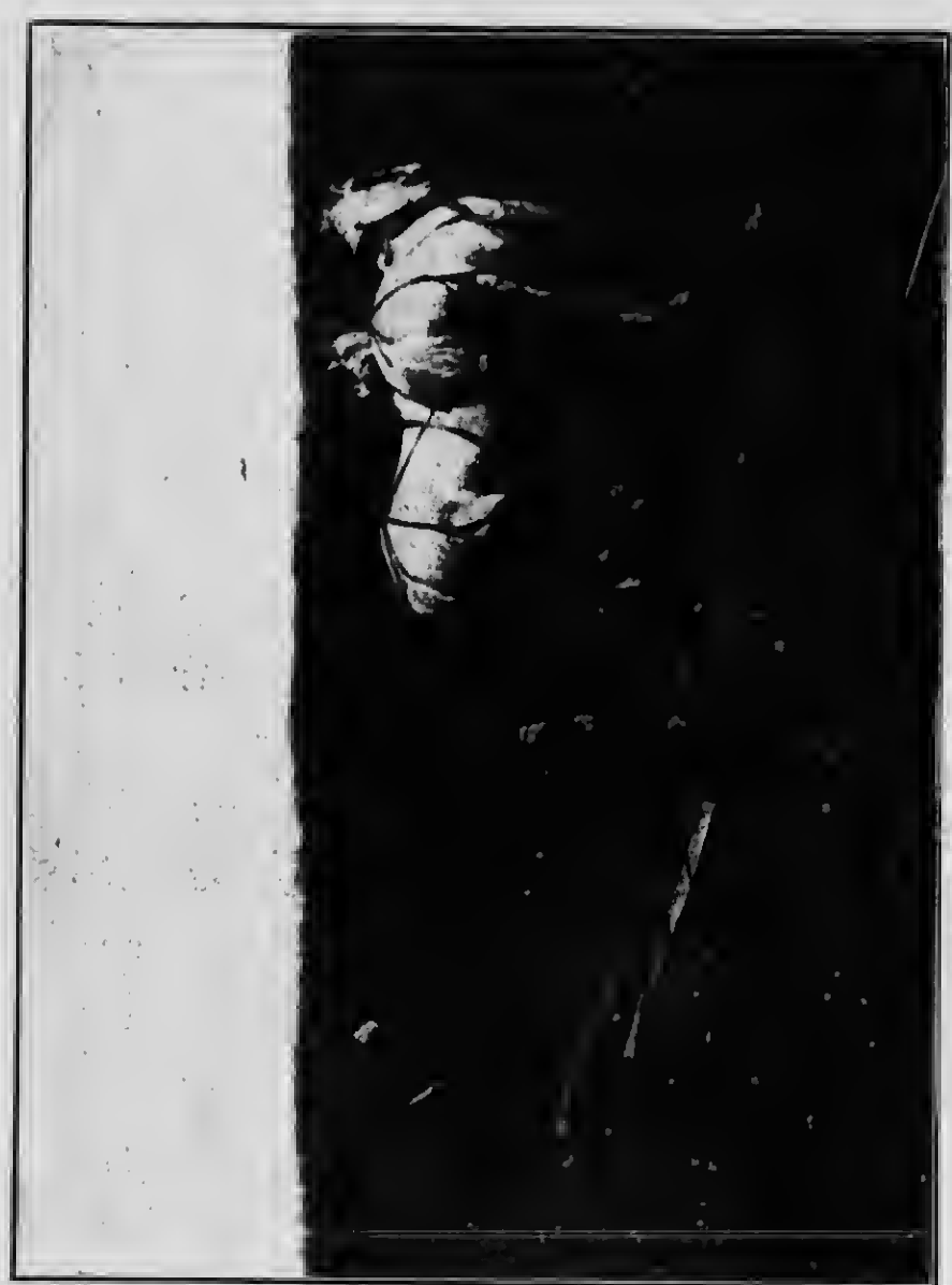
Typical Farming Land in South Ontario.