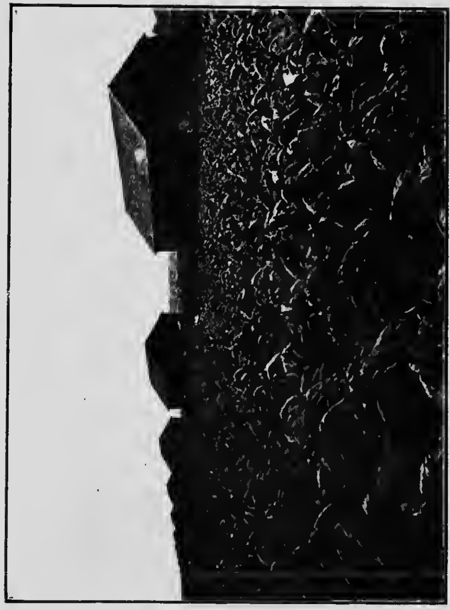
See page 65. Tobacco Field and Curing Sheds in Essex County.