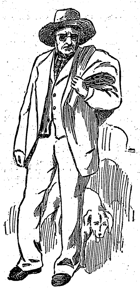
HE SAW A QUEER LITTLE MAN.

'But I promised the boys to run races at four o'clock, and I had no time,' Jamie pro-