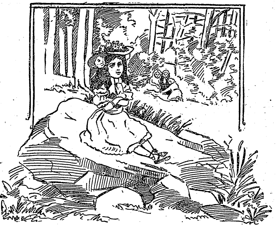
WHEN GRANDMA WAS QUEEN O' THE MAY.