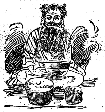
AN AINU TYPE.

He has become so warm that he has thrown off his single garment from one shoulder. His limbs are bared to view, and, indeed, he is a Hairy Ainu. would hardly suspect that this man's voice