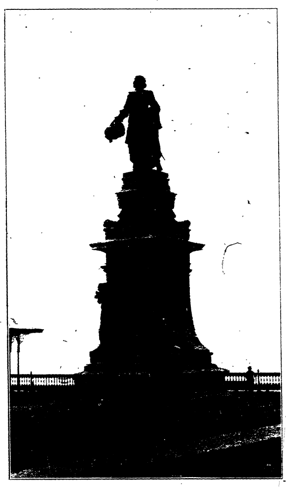
MONUMENT TO CHAMPLAIN. UNVEILED AT QUEBEC, SEPTEMBER, 1898.