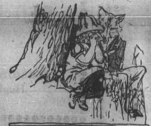
The Wolf tells Red Riding Hood that something dreadful has happened!