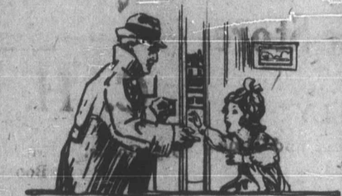
A man called "Daddy" who works to keep the Wolf from the door