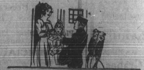
But he finds he has made a mistake—the Canada Life Monthly Income Protection stands between the Wolf and his designs.

A dreadful tale was told the little girl in this story. It was about her Daddy, upon whom everything depended.