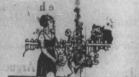
The Wolf who is always prowling around.