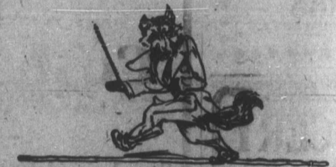
In due time the Wolf of poverty and distress, makes for the home