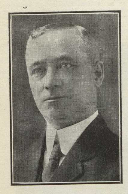
HON. W. J. ROCHE, Minister of the Interior.

The exploration of public lands to determine those which are non-agricultural and therefore fit to be included in forest reserves was continued by seven parties. This covered all the provinces from Manitoba westward, and special attention was given to the survey in advance of settlement in the Peace River country.