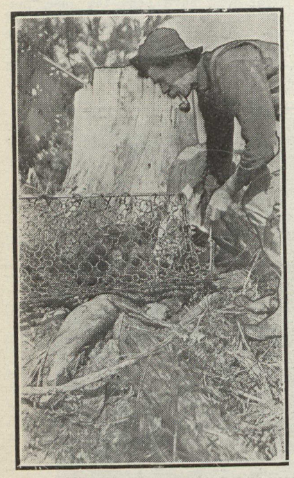
Taking Out a Live Beaver.

The game refuge side of the work has been so successful that the park is in some respects overstocked with game animals, and these can now be taken in considerable numbers from year to year, without endangering the park as a source of supply and without diminishing the number below a safe point. It was first suggested that the Ontario Government would conduct a great fur farm and trap about 1,000 beavers per year, selling the skins. This is done to a considerable extent. But the growth of fur farming and the demand from zoological gardens for live animals has made it more profitable to catch the animals alive.