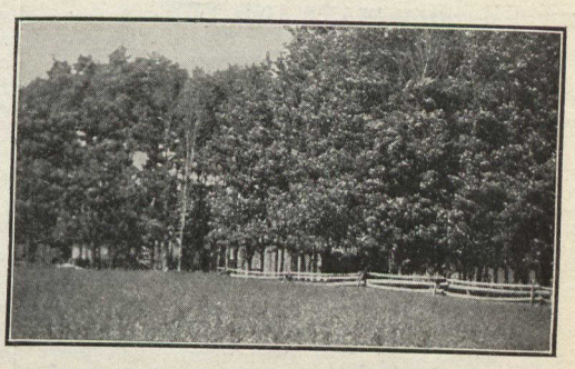
Storms Never Bother This Farmer.

fund of knowledge that every man has, so that the visitor may at once go on increasing his knowledge without having to put on one side what he already knows and learn a new system and a new language. Those who are interested in the museum, or in the preparation of books with a similar purpose, may obtain a copy free upon applying to the Commissioner of Dominion Parks, Department of the Interior, Ottawa.