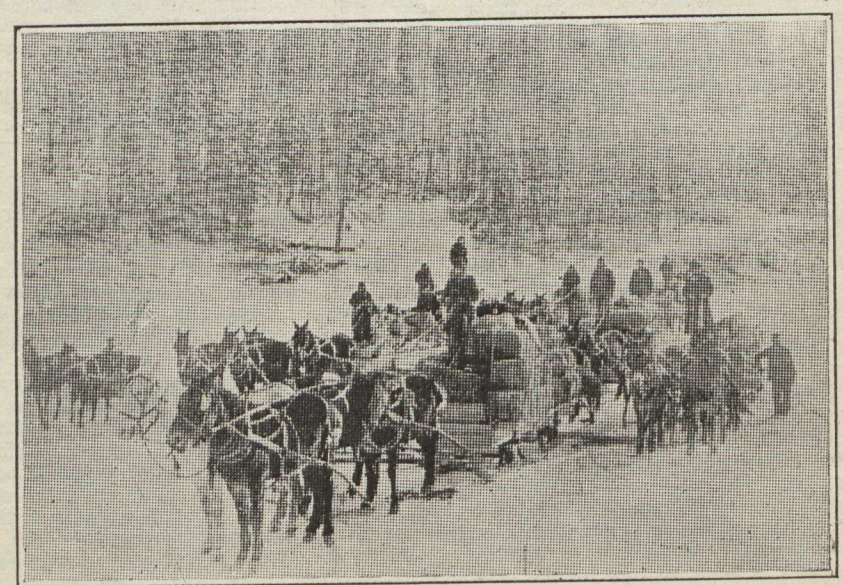
Freighting Supplies to a Lumber Camp.

The Laurentide Company, Limited, is enlarging its forest nurseries in order to provide for the systematic planting, on an increased scale, of considerable areas of nonagricultural, cutover lands in the watershed of the St. Maurice River. This work is being accomplished by the company's forestry division, which has just finished a survey and map of the company's limits, comprising 2,350 square miles of land, mostly timbered. The map shows all drainage, roads, portages and trails, lookout stations, telephone lines, and timber conditions. The company is also importing reindeer from Dr. Grenfell's herd in Newfoundland to take the place of sled dogs, which are very troublesome to keep in the summer and not very efficient in the winter. This experiment is being watched with much interest.—Paper.