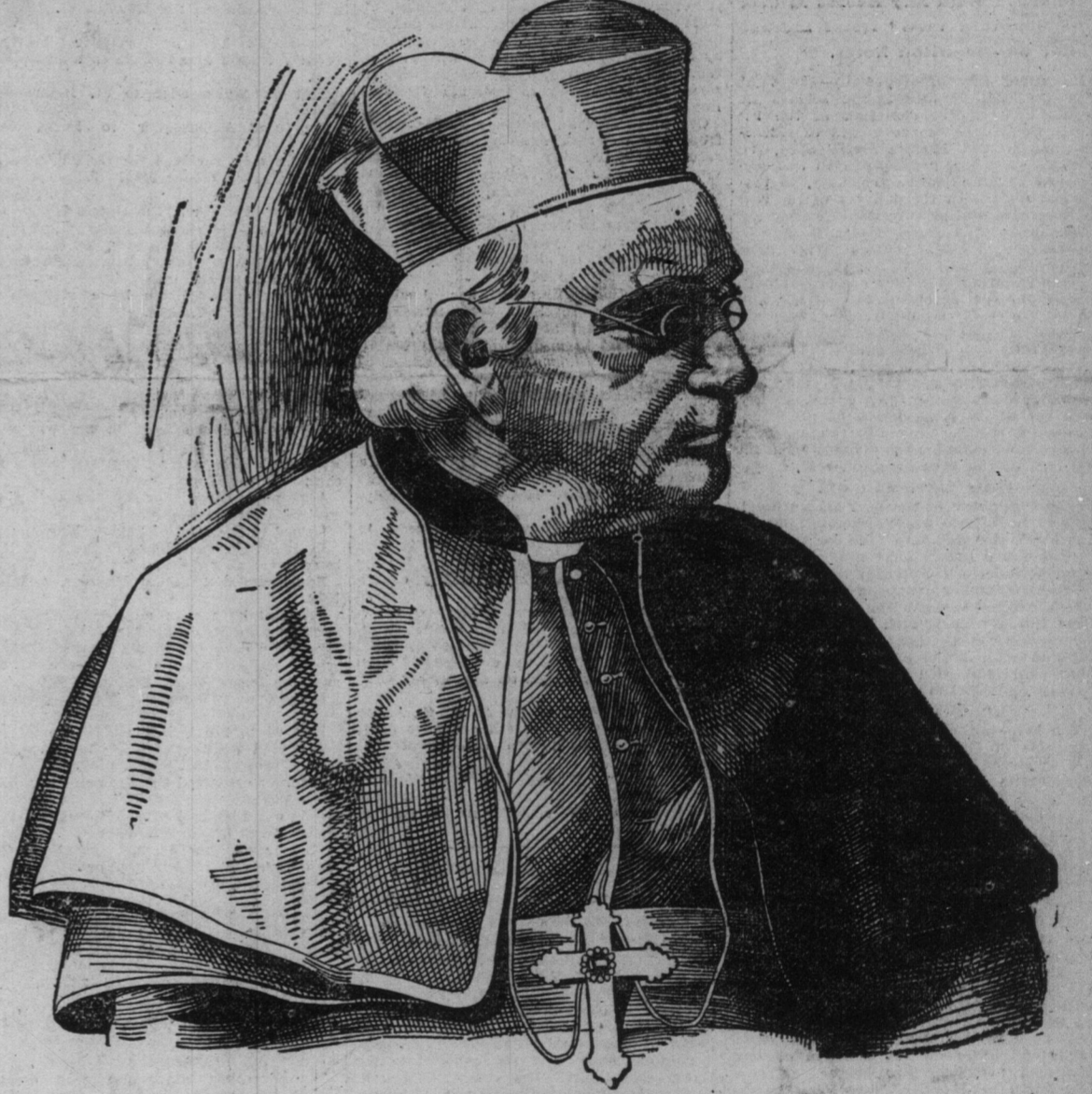
THE LATE ARCHBISHOP OF TORONTO.