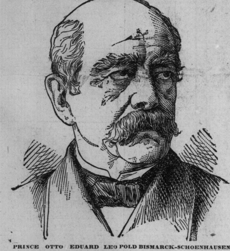
PRINCE OTTO EDUARD LEOPOLD BISMARCK-SCHOENHAUSEN.

Steamship Movements. From Nunidiam.....Father Point.....Liverpool Monmouth.....Father Point.....Liverpool Vancouver.....Father Point.....Bremen Yola.....Father Point.....Siberia La Touraine.....New York.....Havre Amsterdam.....New York.....Rotterdam Corinthia.....Liverpool.....Boston P. R. Luitpold.....Southampton.....New York Milwaukee.....London.....Montreal Sylvia.....Father Point.....Antwerp